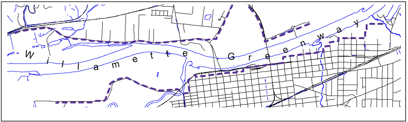
FIGURE 6.510-1. Willamette River Greenway.