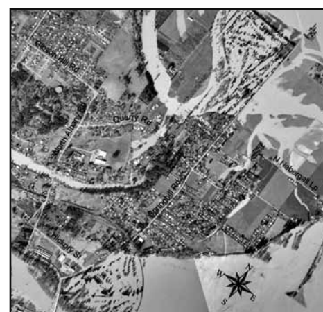
Aerial view of North Albany during the 1996 Willamette River flood.